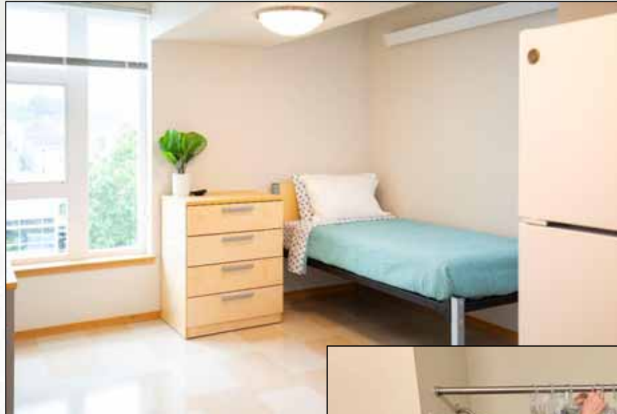
Volunteers prepare a Hobson Place apartment for its new tenant