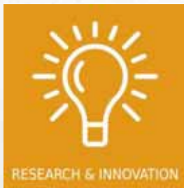
RESEARCH & INNOVATION