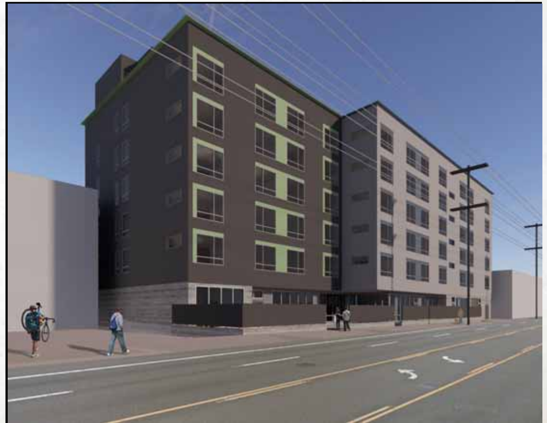
DESC 15th Avenue W building designed by SMR Architects