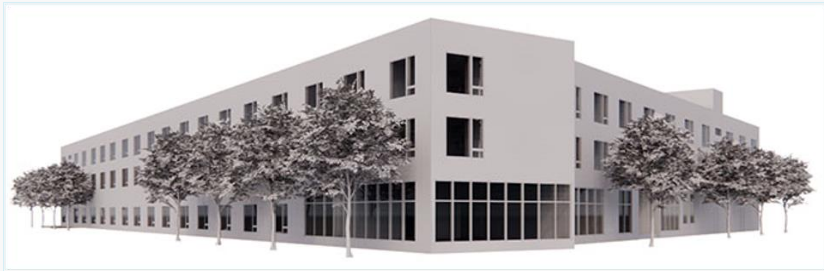
SMR Architects rendering